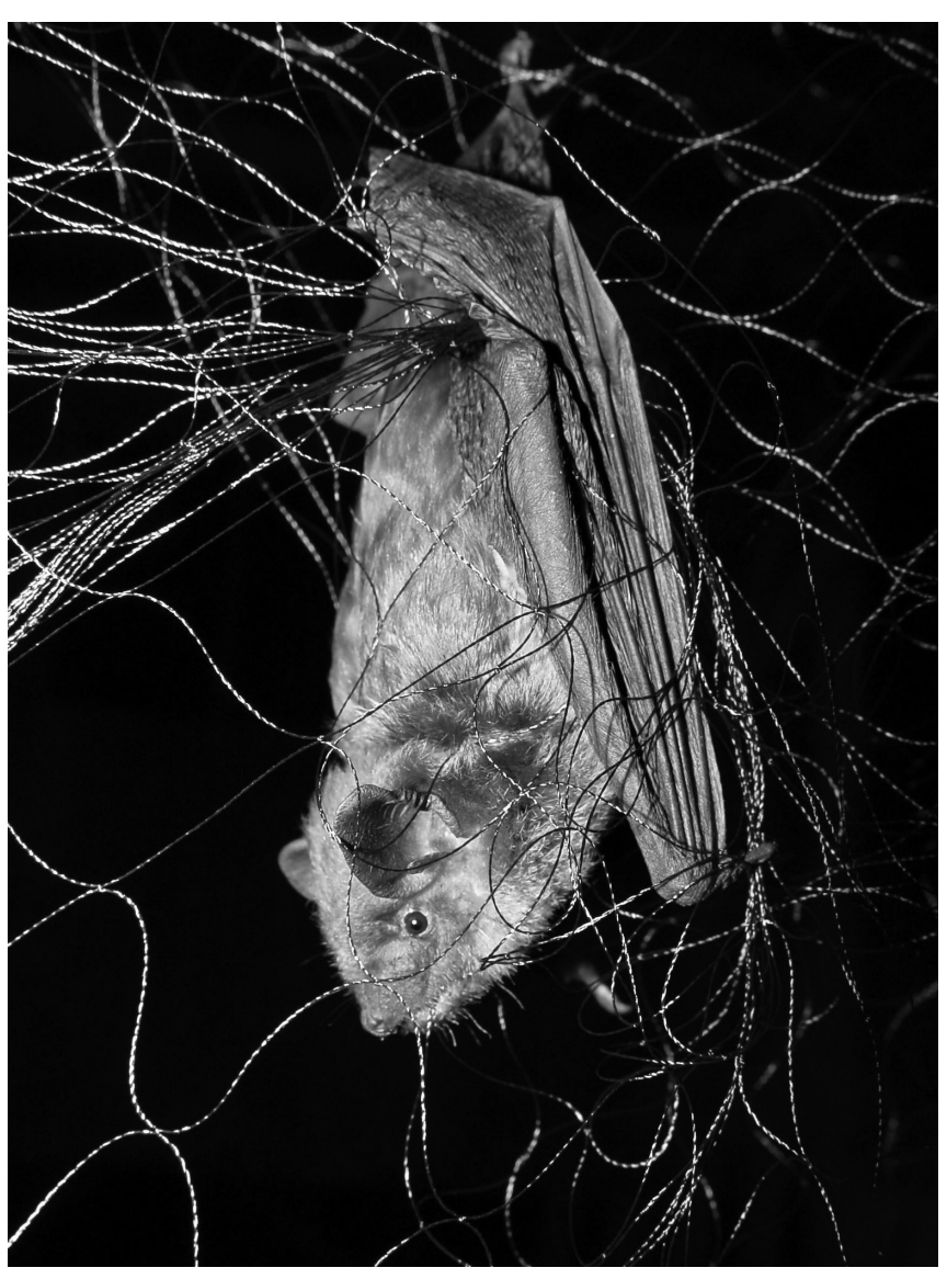
Big brown bat ( Eptesicus fuscus).