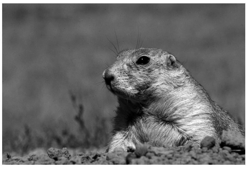
Black-tailed prairie dog ( Cynomys\ ludovicianus ).